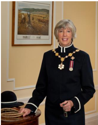
Hon. Judith Guichon